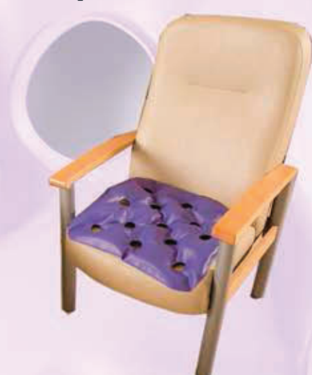
4230 Standard Cushion