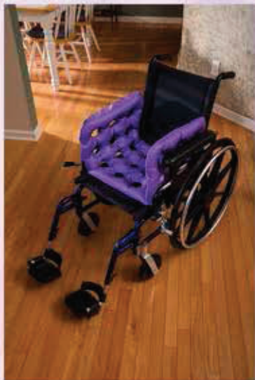
4260 TPU Multi Care Pad