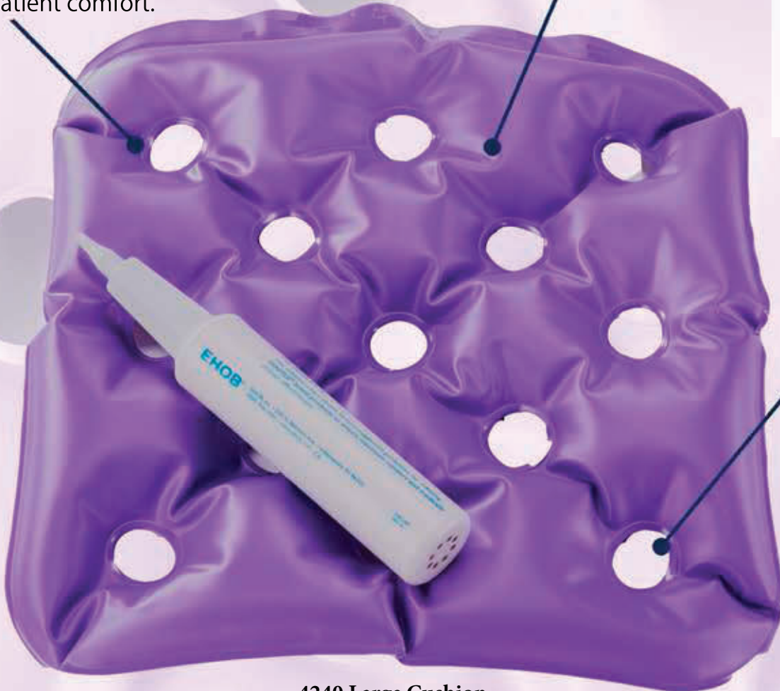
4240 Large Cushion

Pressure distribution results measured with BodiTrak Smart Seat