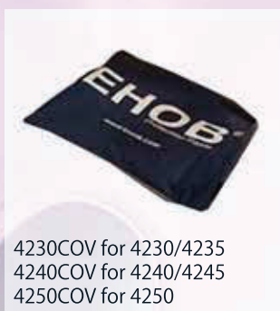
4230COV for 4230/4235 4240COV for 4240/4245 4250COV for 4250