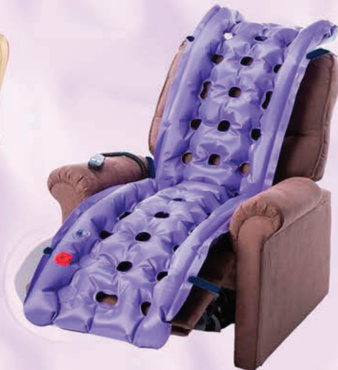
4290 Riser Recliner Pad (long) - DISCONTINUED