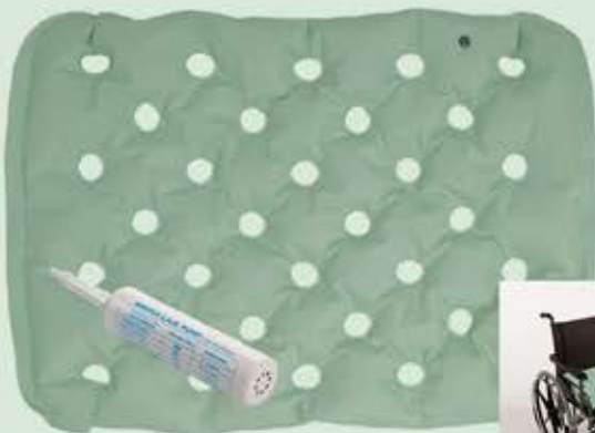
4250A Bariatric Cushion (LAD pump sold separately)